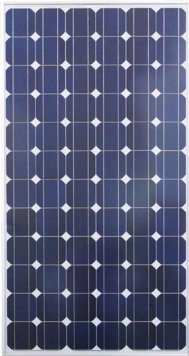
The photo is showing LDAxxx-A11